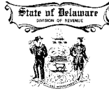
Table A – Computation for Delaware Estate Tax